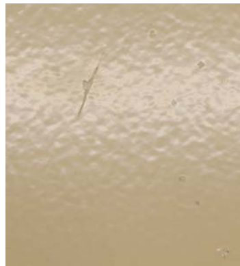
Under white light inspection pinholes are difficult to see.